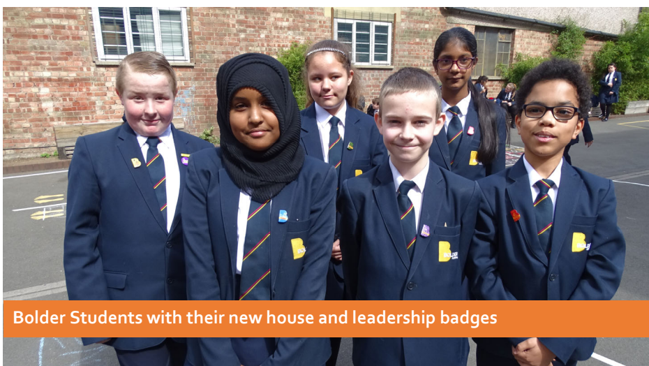
Bolder Students with their new house and leadership badges